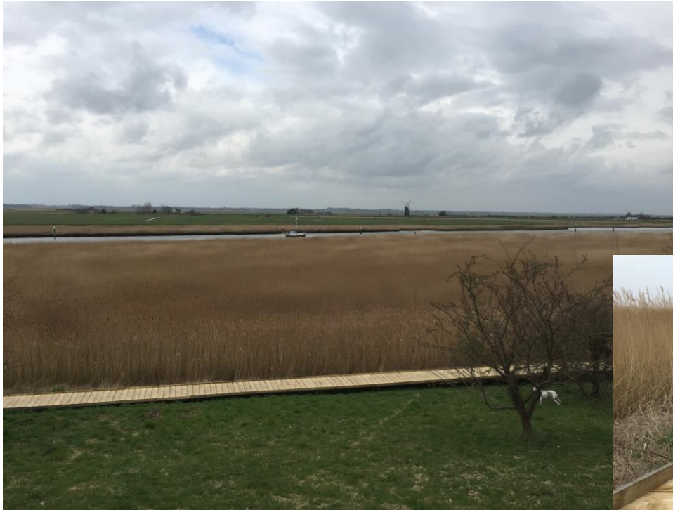
The view of Breydon Water