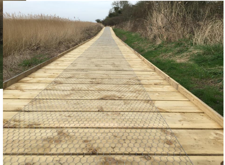
The finished walk with the non-slip wire