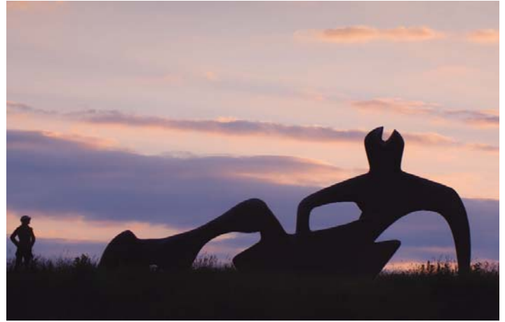
The Henry Moore Foundation, Perry Green

🏠 The Henry Moore Foundation - sculptor Henry Moore (1898-1986) moved here from London in 1940, creating a sculpture area and studio. Permanent exhibition of his work. Open Apr-Sept, by appointment only. Admission charge. (01279) 843333. 🚰