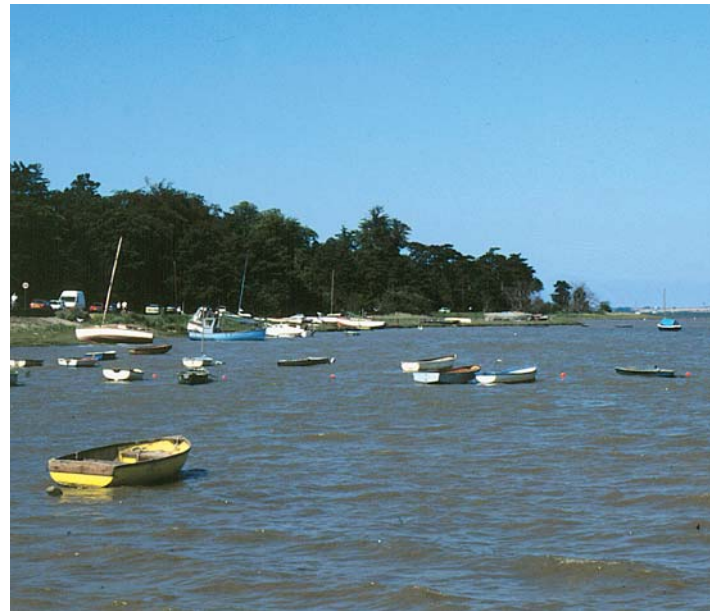
The River Stour

F Wix - church overlooks former abbey. 🏠 🏠