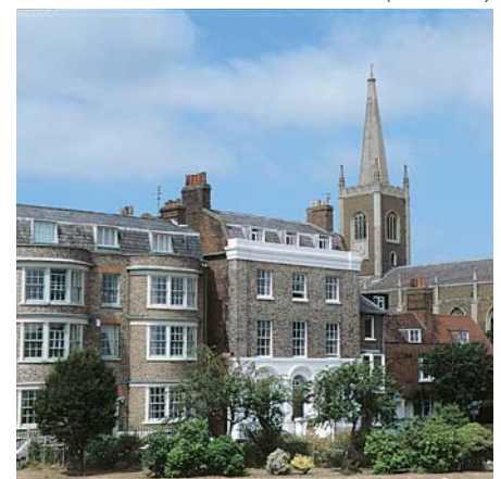
Harwich (Old Town)