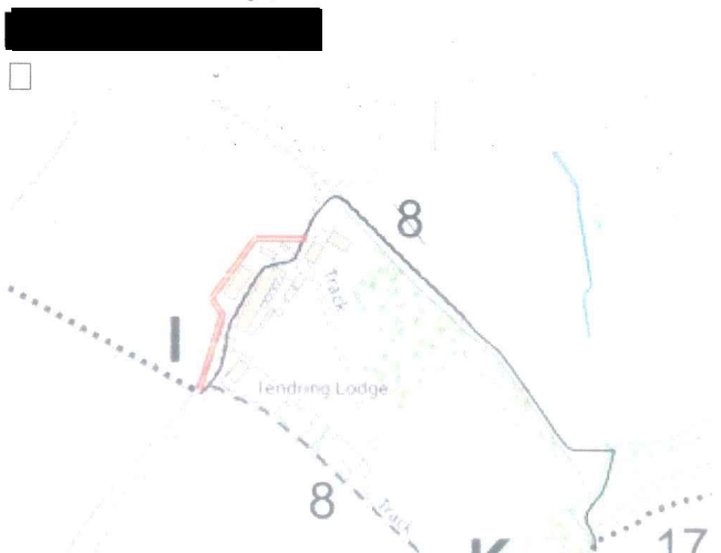
Figure 1a. Suggested footpath diversion around business site