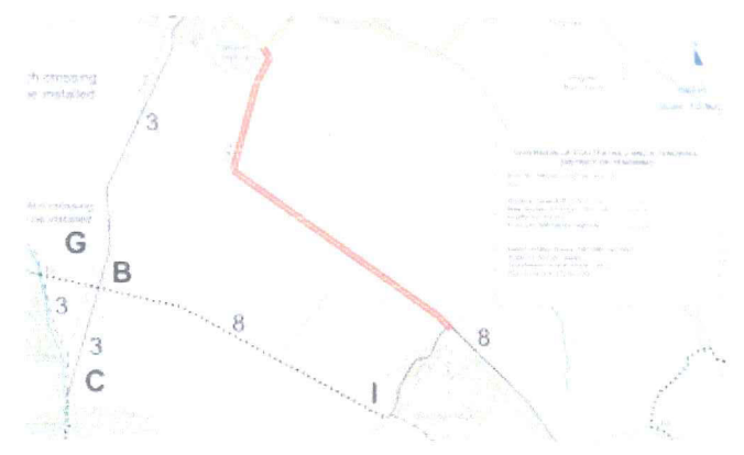
Figure 1b. Suggested footpath creation down along Wolves Hall Lane