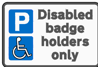
Diagram No: 661A