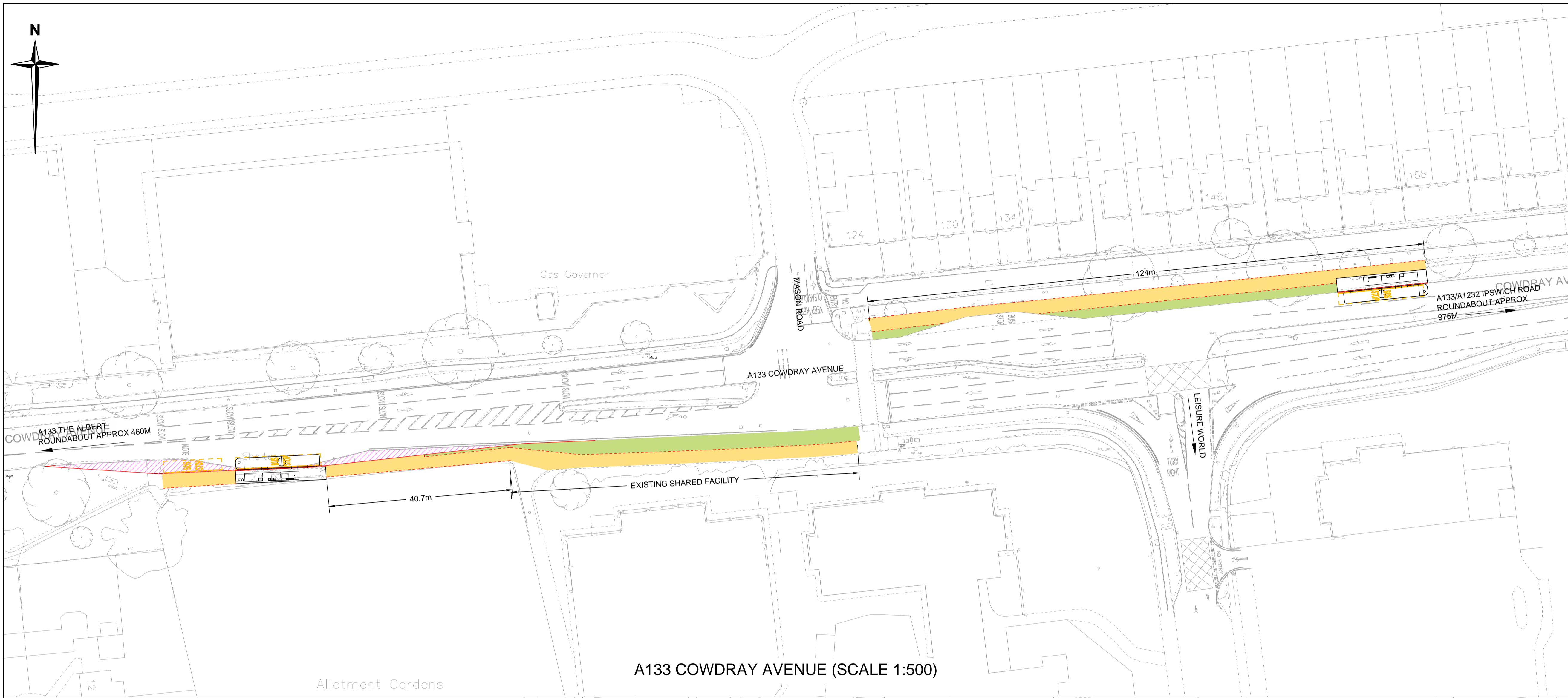
A133 COWDRAY AVENUE (SCALE 1:500)