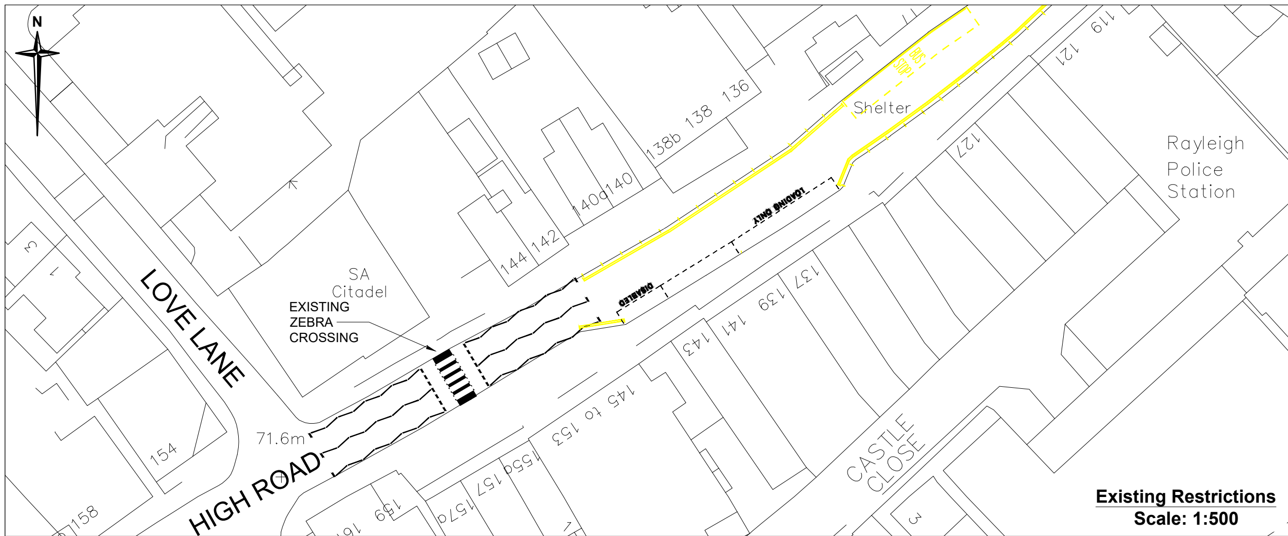
Existing Restrictions Scale: 1:500