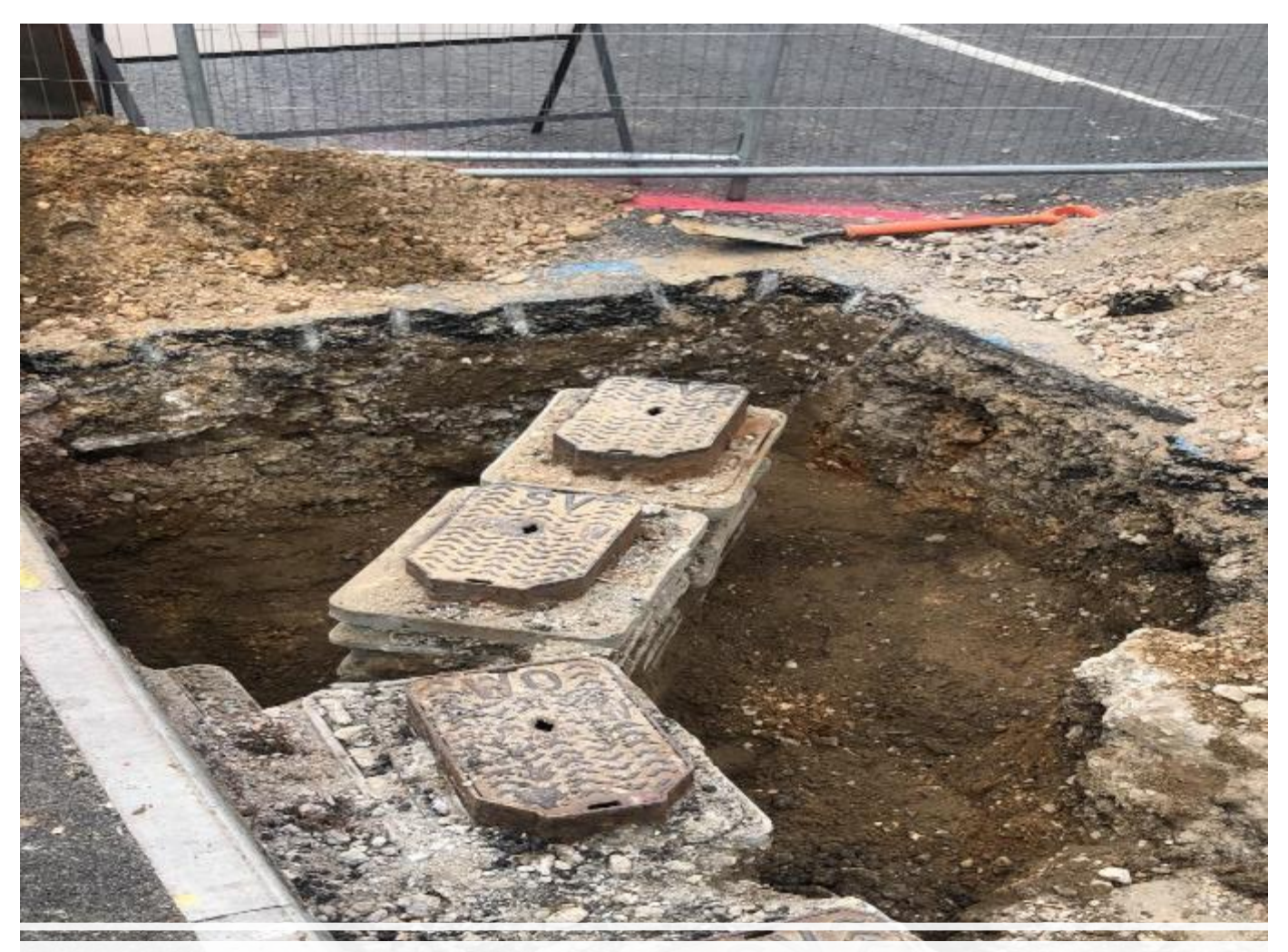
Ipswich Road South Anglian Water valves dug out for final testing in this area.