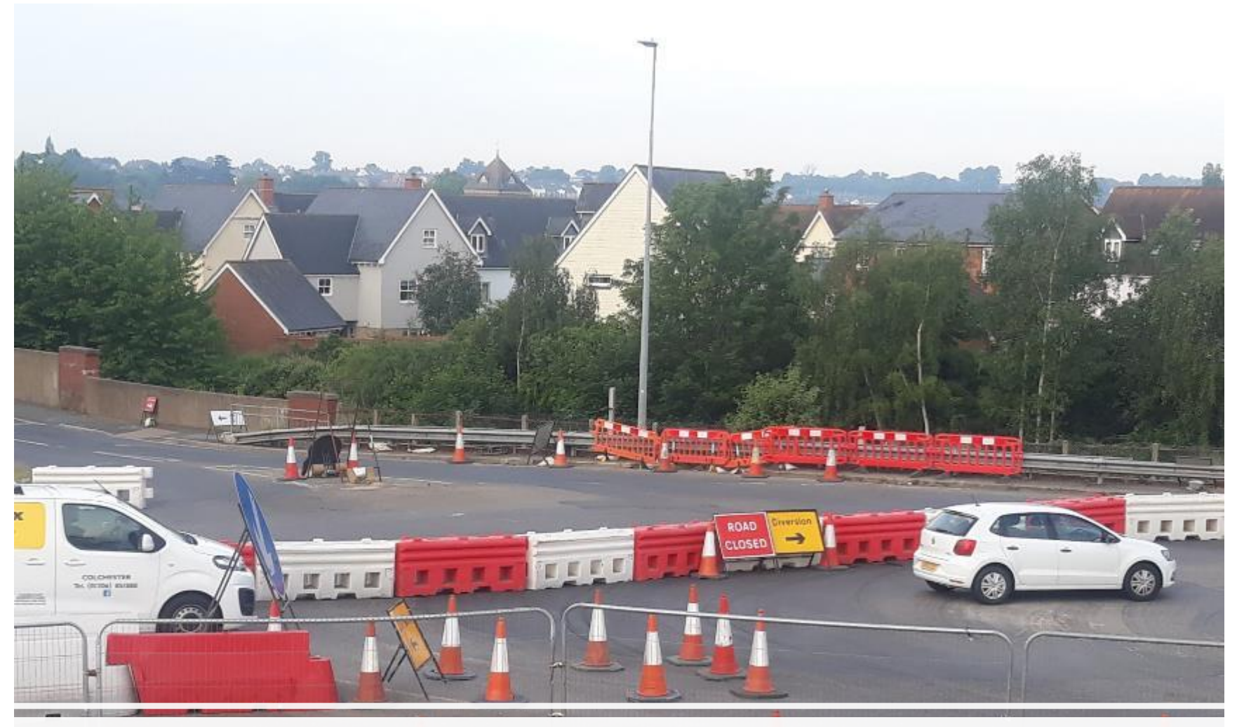
Ipswich Road South Road Closure For Anglian Water diversionary works and Testing.