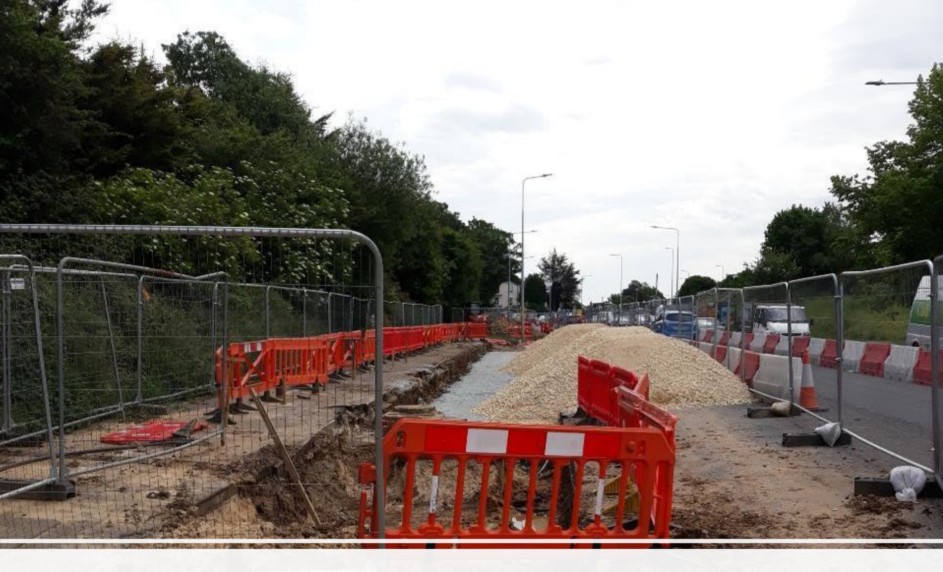
Construction Zone 1B on St Andrews Avenue Eastbound.