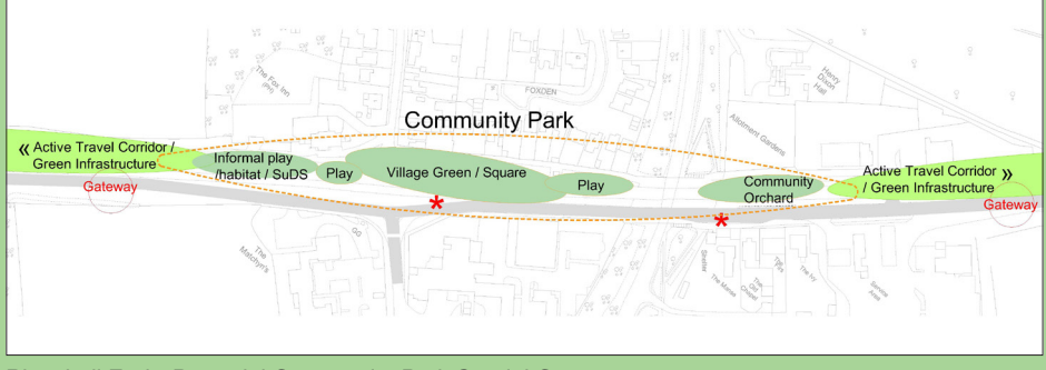
Rivenhall End - Potential Community Park Spatial Concept

The sketch below outlines a potential concept for a new community park in Rivenhall End. If our proposals are taken forward, there would be the opportunity to create a new village focal point in consultation with the local community.