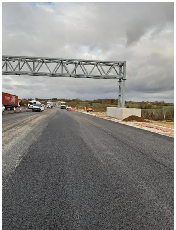
Gantry installation and resurfacing works