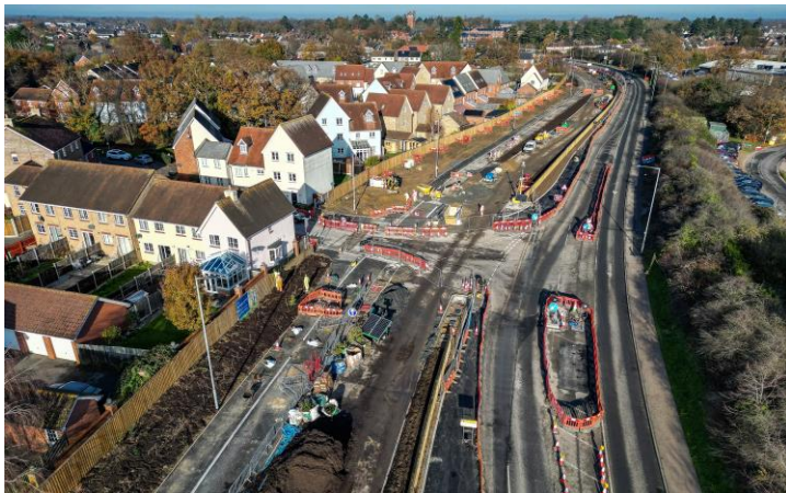
View looking north up Northern Approach Road including Dickenson Road junction (November 2024)