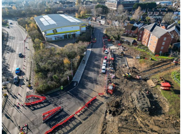
View looking down Bruff Close from Northern Approach Road taken from drone footage in November 2024