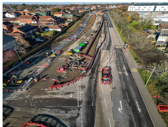
Newly surfaced bus lane and separation island looking south towards Turner Road and aerial view of Wallace Road junction looking north